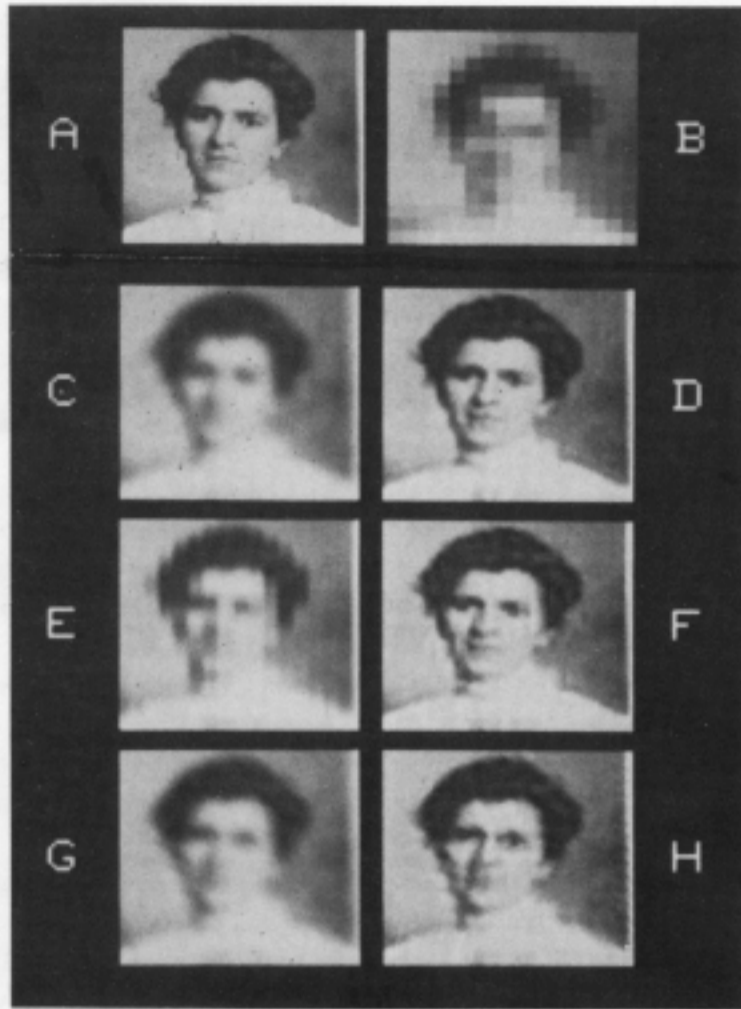
Figure 2. Simulation results. (a) Original 64 \times 64 image. (b) one of the 16 \times 16 low-resolution images. (c) Initial guess with all 16 low-resolution images examined. (d) high-resolution images reconstructed from all 16 images. (e-f) Initial guess and reconstructed image when only 8 low-resolution images were examined. (g-h) Initial guess and reconstructed image when only 4 images were examined.