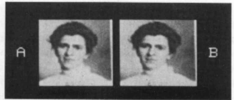
Figure 3. Simulated annealing. (a) Final reconstruction using all 16 images (same as Figure 2d). (b) Final reconstruction using all 16 images and simulated annealing.

regular deblurring: each low-resolution image is a sample of every fourth point at every fourth row from an image created by convolving the original image with the 4 \times 4 matrix. The full blurred image can thus be created from all 16 low-resolution images, and conventional deblurring methods [4] can be used. These methods, however, could not be applied to cases where not all 16 possible low-resolution images are given, cases where the optimization approach is applicable.